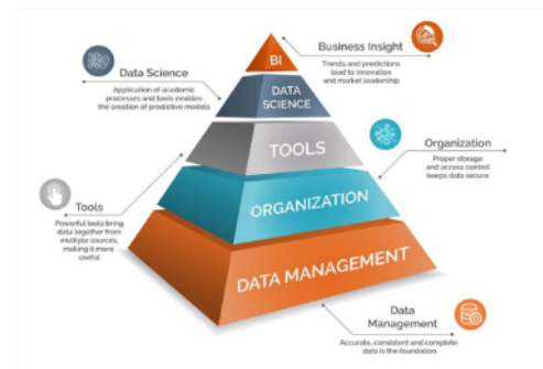
Figure 3: Life blood of Digital Economy